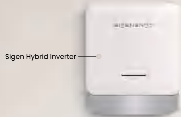
Sigen Hybrid Inverter